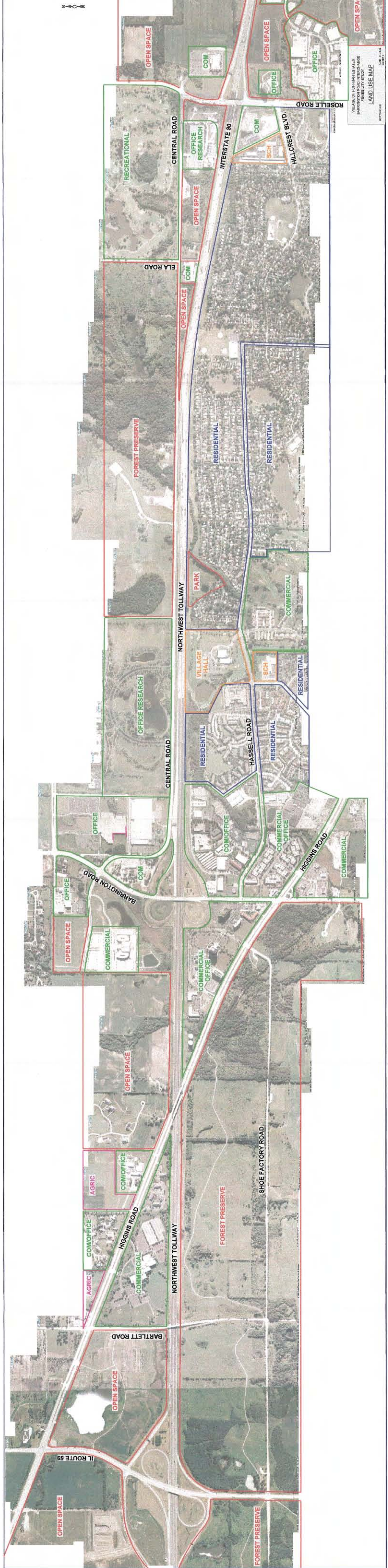
VILLAGE OF HOFFMAN ESTATES BARRINGTON ROAD INTERCHANGE FEASIBILITY STUDY LAND USE MAP DATE: 2-20-04 NET TO SCALE