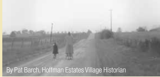
By Pat Barch, Hoffman Estates Village Historian