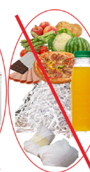
No Food, Liquids, Diapers, or Shredded Paper