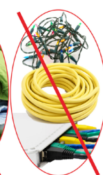
No Hoses, Wires, or Hangers