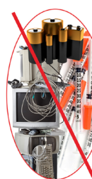
No Batteries, Electronics, or Sharps