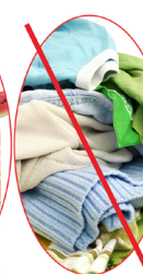
No Clothing or Shoes