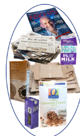
Mixed Paper & Cartons Flatten Boxes