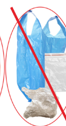
No Plastic Bags or Wrap