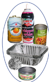
Metal Steel & Aluminum Depressurize Aerosols