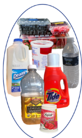
Plastic Bottles - Caps On Preferred, Tubs, Jugs, Jars No Bags, Film, or Foam