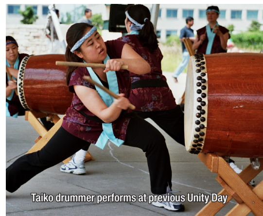
Taiko drummer performs at previous Unity Day

Recent events continue to illustrate the importance of unity, community and connection. While the Cultural Awareness Commission has postponed its planned 2021 Unity Day event due to the ongoing pandemic, the commission has created a video celebration. In "What Does Unity Mean to You," members of the commission share their thoughts on the meaning of unity and how we can celebrate it within our community of Hoffman Estates. The video will air in mid-June on HETV Channel 6/99, as well as on the Village's channel at www.youtube.com/HoffmanEstatesIL .