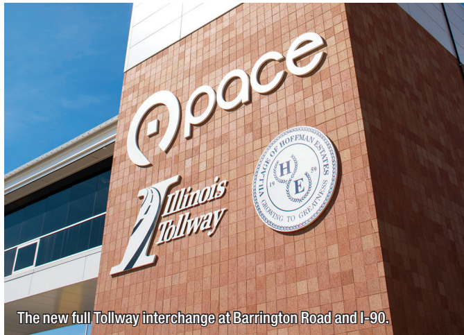
The new full Tollway interchange at Barrington Road and I-90.

Pace Suburban Bus partnered with the Illinois Tollway to work on expanding transit, delivering roadway improvements and improving overall mobility on the Jane Addams Memorial Tollway (I-90). Planning for the Tollway's investment in rebuilding and improving I-90 became a coordinated effort with Pace's plans for its I-90 Market Expansion Project.