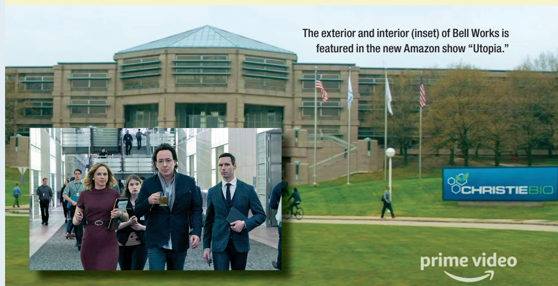
The exterior and interior (inset) of Bell Works is featured in the new Amazon show “Utopia.”

Check these shows out and see if you can spot the Hoffman Estates locations!