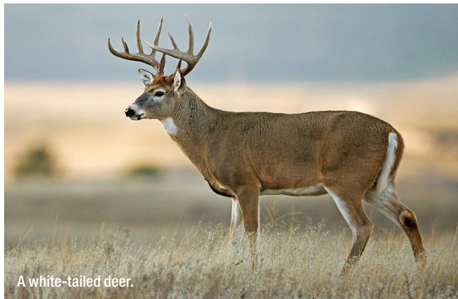
A white-tailed deer.

Visit the Village's website, www.hoffmanestates.org , for the link to the online scavenger hunt. Hurry, the scavenger hunt closes Monday, Nov. 30, at 5 p.m. Happy hunting!