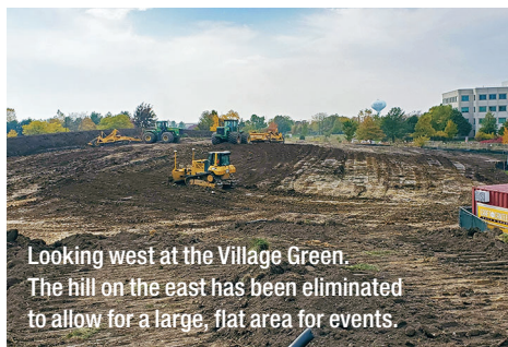
Looking west at the Village Green. The hill on the east has been eliminated to allow for a large, flat area for events.

A grading and utility project is underway at the Virginia Mary Hayter Village Green. The Village Green Phase I Improvement Project includes the creation of an entry plaza, a central plaza and an enhanced viewing hill for productions at the amphitheater. The east side of the park will be made level for future use, and lighting will be updated throughout the Phase I area. The work is taking place south of the Hideaway Brew Garden and the amphitheater. For more information Village Green Phase I Improvement Project, visit www.hoffmanestates.org/villagegreen .