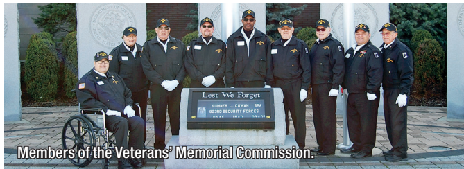
Members of the Veterans' Memorial Commission.

Due to continuing COVID-19-related restrictions, the Village has canceled all in-person events through the end of 2020, including the annual Veterans Day Ceremony. However, to properly honor those who gave so much for our country, Veterans' Memorial Commission members will be holding a private commemoration (no public service), freshening the veterans' wreaths and observing a moment of silence at 11 a.m.