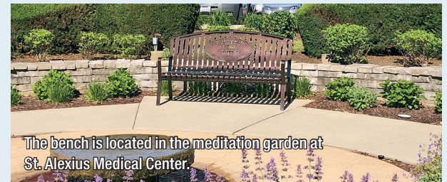
The bench is located in the meditation garden at St. Alexius Medical Center.

On Wednesday, Oct. 7, members of St. Alexius Medical Center Donation Committee and the Gift of Hope Organ and Tissue Donor Network will honor donors with a special ceremony. A beautiful bench will be permanently installed in the hospital's meditation garden to honor donors, as well as their loved ones. Organ and tissue donation is a life-giving gesture of hope! For more information on becoming an organ donor, visit www.giftofhope.org .