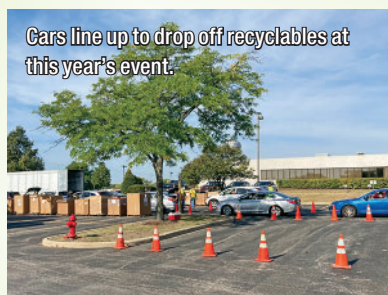
Cars line up to drop off recyclables at this year's event.

Over 720 cars stopped by the Susan H. Kenley-Rupnow Public Works Center to drop off their various recyclables, which included over 22,000 pounds of documents (filling nearly three full trucks!), 321 containers of paint, four large pallets of fluorescent and compact fluorescent lamp (CFL) light bulbs, two large bins of ink cartridges, and eight large bins of expired drugs/sharps. Additionally, the event collected over 17,000 pounds of electronic items!