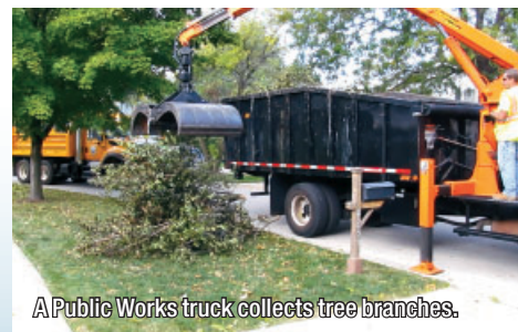
A Public Works truck collects tree branches.

Visit www.hoffmanestates.org/branchpickup for more information.