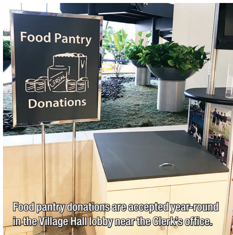
Food pantry donations are accepted year-round in the Village Hall lobby near the Clerk's office.

While there is no Fourth of July parade this year, the Celebrations Commission is still accepting donations of non-perishable canned/boxed goods and paper products at the Village Hall during normal business hours. These donations will be used to replenish area township food pantries. Monetary donations will also be accepted.