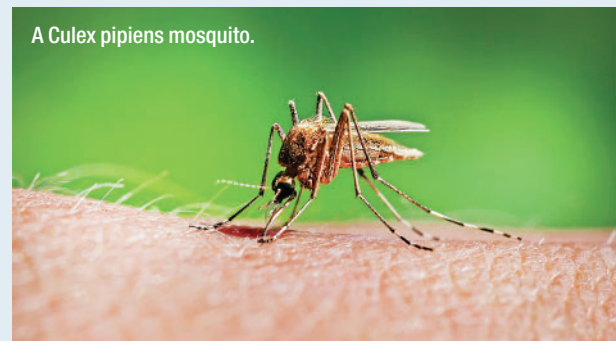
A Culex pipiens mosquito.

Monitoring for West Nile virus in Illinois includes laboratory tests for mosquito batches, dead crows, blue jays, robins and other perching birds, as well as testing sick horses and humans with West Nile virus-like symptoms. Hoffman Estates residents who see a sick or dying perching bird should contact the Northwest Mosquito Abatement District (NWMAD) at office@nwmadil.com or 847-537-2306.