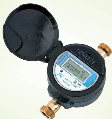
An example of a new water meter.

Residents and businesses will receive a postcard in the mail with instructions on how to schedule their meter replacement. Appointments typically take no longer than 30 minutes, and there are a number of appointment dates and times available.