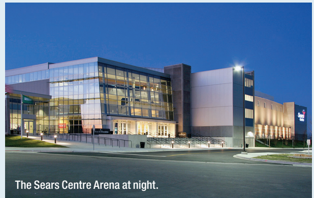
The Sears Centre Arena at night.

Sears Centre events may be canceled due to COVID-19. Please confirm by visiting www.searscentre.com for updated information.