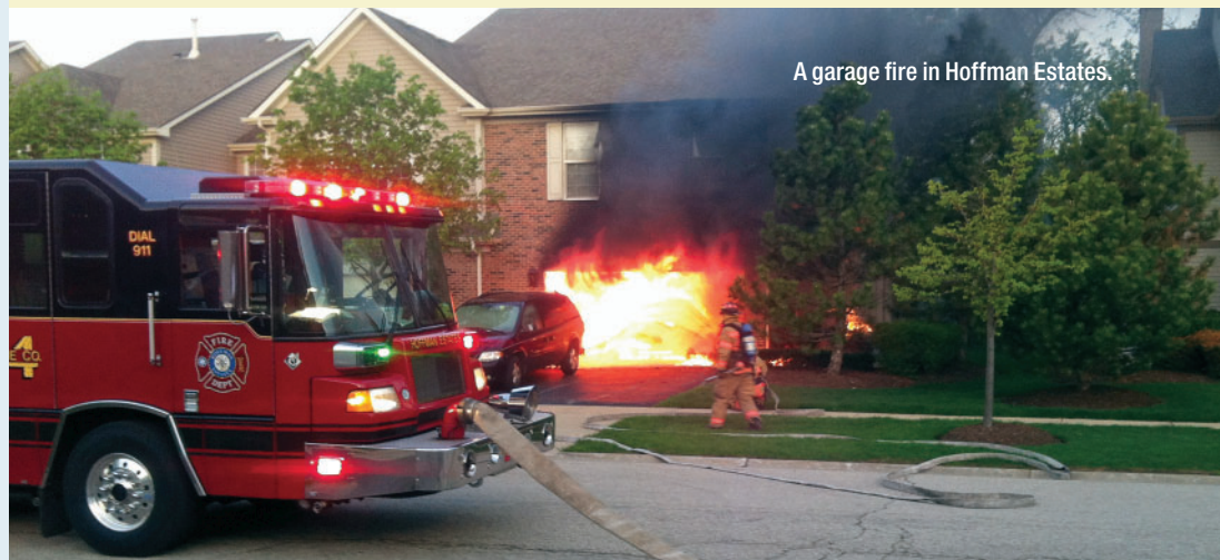
A garage fire in Hoffman Estates.

For more information, call the Hoffman Estates Fire Prevention Bureau at 847-843-4835.