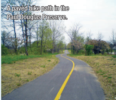
A paved bike path in the Paul Douglas Preserve.

As the weather improves, have you been thinking about taking your bike out for a ride? Whether using bike paths, bike lanes or local streets in and around the Village, there are a few tips and reminders to keep bicyclists, pedestrians, and motorists safe.