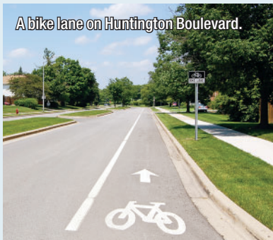
A bike lane on Huntington Boulevard.