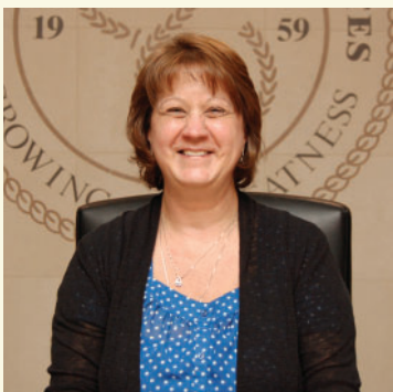
By Bev Romanoff Hoffman Estates Village Clerk