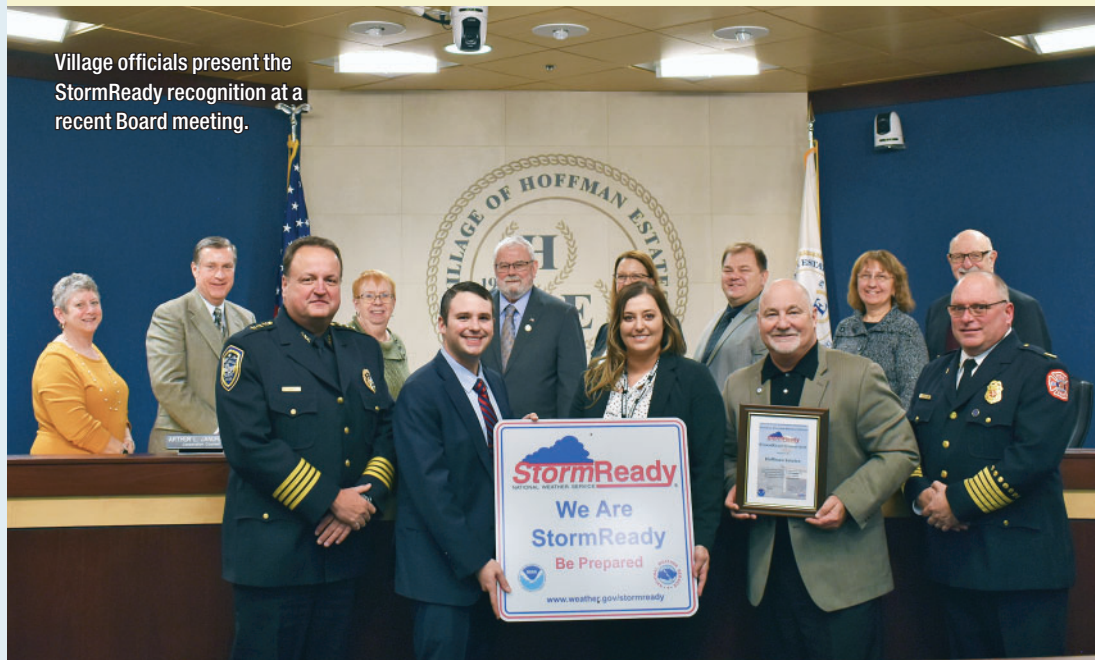
Village officials present the StormReady recognition at a recent Board meeting.

More information about regional emergency management initiatives can be found at www.nwcds.org/jems.html . To learn more about the Village's emergency management efforts, visit www.hoffmanestates.org/ema .