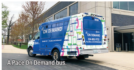
A Pace On Demand bus.

Effective March 2, Pace will expand its Hoffman Estates On Demand bus service hours to approximately 6 a.m. to 6:30 p.m. on weekdays. At this time, Pace is not changing the service area boundary for On Demand. Also, the Route 612 – Barrington Road Circulator will be discontinued on March 2 due to low ridership. The expansion of the On Demand hours compensate for the elimination of Route 612 by including the same service hours as had been used for Route 612. Pace On Demand offers reservation-based, shared-ride service in 11 designated service areas throughout the suburban region. All you have to do is book online or call to reserve your trip at least one hour in advance. Visit www.pacebus.com for more information about Pace's On Demand services.