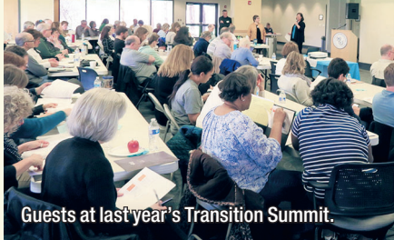
Guests at last year's Transition Summit.

The Commission for People with Disabilities, in partnership with Connect to Community and the Northwest Suburban Special Education Organization (NS-SEO), announces its sixth annual Transition Summit on Saturday, April 18, from 9 a.m. to 3 p.m. at the Village Hall.