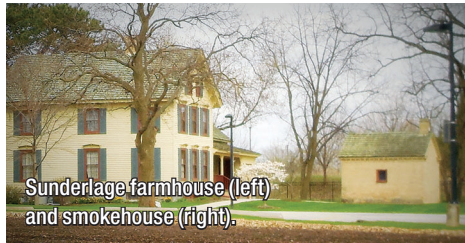
Sunderlage farmhouse (left) and smokehouse (right).

The Historical Sites Commission invites history enthusiasts to visit "Our Old House" on Saturday, March 21, from 10 a.m. to noon at Sunderlage House, 1775 Vista Lane. This free event will examine the history of the 1856 farmhouse, including the layout of its rooms, floors, staircase and basement. The smokehouse, which is listed in the National Register of Historic Places for its mid-19th century Greek Revival style, will also be open. Photos, blueprints and maps will be on display. For more information, call 847-781-2606.