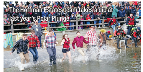
The Hoffman Estates team takes a dip at last year's Polar Plunge.