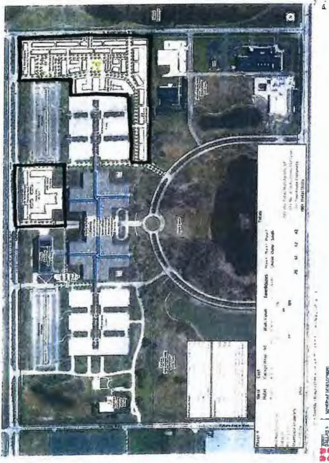
EXHIBIT B Concept Site Plan