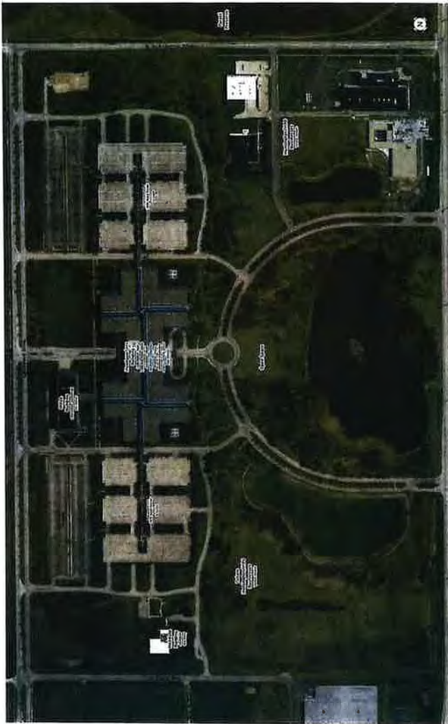
APRIL 2018 CITY OF LAKWOOD 2017 2018 2019 2020 2021 2022 2023 2024 2025 2026 2027 2028 2029 2030 2031 2032 2033 2034 2035 2036 2037 2038 2039 2040 2041 2042 2043 2044 2045 2046 2047 2048 2049 2050 2051 2052 2053 2054 2055 2056 2057 2058 2059 2060 2061 2062 2063 2064 2065 2066 2067 2068 2069 2070 2071 2072 2073 2074 2075 2076 2077 2078 2079 2080 2081 2082 2083 2084 2085 2086 2087 2088 2089 2090 2091 2092 2093 2094 2095 2096 2097 2098 2099 2100 2101 2102 2103 2104 2105 2106 2107 2108 2109 2110 2111 2112 2113 2114 2115 2116 2117 2118 2119 2120 2121 2122 2123 2124 2125 2126 2127 2128 2129 2130 2131 2132 2133 2134 2135 2136 2137 2138 2139 2140 2141 2142 2143 2144 2145 2146 2147 2148 2149 2150 2151 2152 2153 2154 2155 2156 2157 2158 2159 2160 2161 2162 2163 2164 2165 2166 2167 2168 2169 2170 2171 2172 2173 2174 2175 2176 2177 2178 2179 2180 2181 2182 2183 2184 2185 2186 2187 2188 2189 2190 2191 2192 2193 2194 2195 2196 2197 2198 2199 2200 2201 2202 2203 2204 2205 2206 2207 2208 2209 2210 2211 2212 2213 2214 2215 2216 2217 2218 2219 2220 2221 2222 2223 2224 2225 2226 2227 2228 2229 2230 2231 2232 2233 2234 2235 2236 2237 2238 2239 2240 2241 2242 2243 2244 2245 2246 2247 2248 2249 2250 2251 2252 2253 2254 2255 2256 2257 2258 2259 2260 2261 2262 2263 2264 2265 2266 2267 2268 2269 2270 2271 2272 2273 2274 2275 2276 2277 2278 2279 2280 2281 2282 2283 2284 2285 2286 2287 2288 2289 2290 2291 2292 2293 2294 2295 2296 2297 2298 2299 2300 2301 2302 2303 2304 2305 2306 2307 2308 2309 2310 2311 2312 2313 2314 2315 2316 2317 2318 2319 2320 2321 2322 2323 2324 2325 2326 2327 2328 2329 2330 2331 2332 2333 2334 2335 2336 2337 2338 2339 2340 2341 2342 2343 2344 2345 2346 2347 2348 2349 2350 2351 2352 2353 2354 2355 2356 2357 2358 2359 2360 2361 2362 2363 2364 2365 2366 2367 2368 2369 2370 2371 2372 2373 2374 2375 2376 2377 2378 2379 2380 2381 2382 2383 2384 2385 2386 2387 2388 2389 2390 2391 2392 2393 2394 2395 2396 2397 2398 2399 2400 2401 2402 2403 2404 2405 2406 2407 2408 2409 2410 2411 2412 2413 2414 2415 2416 2417 2418 2419 2420 2421 2422 2423 2424 2425 2426 2427 2428 2429 2430 2431 2432 2433 2434 2435 2436 2437 2438 2439 2440 2441 2442 2443 2444 2445 2446 2447 2448 2449 2450 2451 2452 2453 2454 2455 2456 2457 2458 2459 2460 2461 2462 2463 2464 2465 2466 2467 2468 2469 2470 2471 2472 2473 2474 2475 2476 2477 2478 2479 2480 2481 2482 2483 2484 2485 2486 2487 2488 2489 2490 2491 2492 2493 2494 2495 2496 2497 2498 2499 2500 2501 2502 2503 2504 2505 2506 2507 2508 2509 2510 2511 2512 2513 2514 2515 2516 2517 2518 2519 2520 2521 2522 2523 2524 2525 2526 2527 2528 2529 2530 2531 2532 2533 2534 2535 2536 2537 2538 2539 2540 2541 2542 2543 2544 2545 2546 2547 2548 2549 2550 2551 2552 2553 2554 2555 2556 2557 2558 2559 2560 2561 2562 2563 2564 2565 2566 2567 2568 2569 2570 2571 2572 2573 2574 2575 2576 2577 2578 2579 2580 2581 2582 2583 2584 2585 2586 2587 2588 2589 2590 2591 2592 2593 2594 2595 2596 2597 2598 2599 2600 2601 2602 2603 2604 2605 2606 2607 2608 2609 2610 2611 2612 2613 2614 2615 2616 2617 2618 2619 2620 2621 2622 2623 2624 2625 2626 2627 2628 2629 2630 2631 2632 2633 2634 2635 2636 2637 2638 2639 2640 2641 2642 2643 2644 2645 2646 2647 2648 2649 2650 2651 2652 2653 2654 2655 2656 2657 2658 2659 2660 2661 2662 2663 2664 2665 2666 2667 2668 2669 2670 2671 2672 2673 2674 2675 2676 2677 2678 2679 2680 2681 2682 2683 2684 2685 2686 2687 2688 2689 2690 2691 2692 2693 2694 2695 2696 2697 2698 2699 2700 2701 2702 2703 2704 2705 2706 2707 2708 2709 2710 2711 2712 2713 2714 2715 2716 2717 2718 2719 2720 2721 2722 2723 2724 2725 2726 2727 2728 2729 2730 2731 2732 2733 2734 2735 2736 2737 2738 2739 2740 2741 2742 2743 2744 2745 2746 2747 2748 2749 2750 2751 2752 2753 2754 2755 2756 2757 2758 2759 2760 2761 2762 2763 2764 2765 2766 2767 2768 2769 2770 2771 2772 2773 2774 2775 2776 2777 2778 2779 2780 2781 2782 2783 2784 2785 2786 2787 2788 2789 2790 2791 2792 2793 2794 2795 2796 2797 2798 2799 2800 2801 2802 2803 2804 2805 2806 2807 2808 2809 2810 2811 2812 2813 2814 2815 2816 2817 2818 2819 2820 2821 2822 2823 2824 2825 2826 2827 2828 2829 2830 2831 2832 2833 2834 2835 2836 2837 2838 2839 2840 2841 2842 2843 2844 2845 2846 2847 2848 2849 2850 2851 2852 2853 2854 2855 2856 2857 2858 2859 2860 2861 2862 2863 2864 2865 2866 2867 2868 2869 2870 2871 2872 2873 2874 2875 2876 2877 2878 2879 2880 2881 2882 2883 2884 2885 2886 2887 2888 2889 2890 2891 2892 2893 2894 2895 2896 2897 2898 2899 2900 2901 2902 2903 2904 2905 2906 2907 2908 2909 2910 2911 2912 2913 2914 2915 2916 2917 2918 2919 2920 2921 2922 2923 2924 2925 2926 2927 2928 2929 2930 2931 2932 2933 2934 2935 2936 2937 2938 2939 2940 2941 2942 2943 2944 2945 2946 2947 2948 2949 2950 2951 2952 2953 2954 2955 2956 2957 2958 2959 2960 2961 2962 2963 2964 2965 2966 2967 2968 2969 2970 2971 2972 2973 2974 2975 2976 2977 2978 2979 2980 2981 2982 2983 2984 2985 2986 2987 2988 2989 2990 2991 2992 2993 2994 2995 2996 2997 2998 2999 3000 3001 3002 3003 3004 3005 3006 3007 3008 3009 3010 3011 3012 3013 3014 3015 3016 3017 3018 3019 3020 3021 3022 3023 3024 3025 3026 3027 3028 3029 3030 3031 3032 3033 3034 3035 3036 3037 3038 3039 3040 3041 3042 3043 3044 3045 3046 3047 3048 3049 3050 3051 3052 3053 3054 3055 3056 3057 3058 3059 3060 3061 3062 3063 3064 3065 3066 3067 3068 3069 3070 3071 3072 3073 3074 3075 3076 3077 3078 3079 3080 3081 3082 3083 3084 3085 3086 3087 3088 3089 3090 3091 3092 3093 3094 3095 3096 3097 3098 3099 3100 3101 3102 3103 3104 3105 3106 3107 3108 3109 3110 3111 3112 3113 3114 3115 3116 3117 3118 3119 3120 3121 3122 3123 3124 3125 3126 3127 3128 3129 3130 3131 3132 3133 3134 3135 3136 3137 3138 3139 3140 3141 3142 3143 3144 3145 3146 3147 3148 3149 3150 3151 3152 3153 3154 3155 3156 3157 3158 3159 3160 3161 3162 3163 3164 3165 3166 3167 3168 3169 3170 3171 3172 3173 3174 3175 3176 3177 3178 3179 3180 3181 3182 3183 3184 3185 3186 3187 3188 3189 3190 3191 3192 3193 3194 3195 3196 3197 3198 3199 3200 3201 3202 3203 3204 3205 3206 3207 3208 3209 3210 3211 3212 3213 3214 3215 3216 3217 3218 3219 3220 3221 3222 3223 3224 3225 3226 3227 3228 3229 3230 3231 3232 3233 3234 3235 3236 3237 3238 3239 3240 3241 3242 3243 3244 3245 3246 3247 3248 3249 3250 3251 3252 3253 3254 3255 3256 3257 3258 3259 3260 3261 3262 3263 3264 3265 3266 3267 3268 3269 3270 3271 3272 3273 3274 3275 3276 3277 3278 3279 3280 3281 3282 3283 3284 3285 3286 3287 3288 3289 3290 3291 3292 3293 3294 3295 3296 3297 3298 3299 3300 3301 3302 3303 3304 3305 3306 3307 3308 3309 3310 3311 3312 3313 3314 3315 3316 3317 3318 3319 3320 3321 3322 3323 3324 3325 3326 3327 3328 3329 3330 3331 3332 3333 3334 3335 3336 3337 3338 3339 3340 3341 3342 3343 3344 3345 3346 3347 3348 3349 3350 3351 3352 3353 3354 3355 3356 3357 3358 3359 3360 3361 3362 3363 3364 3365 3366 3367 3368 3369 3370 3371 3372 3373 3374 3375 3376 3377 3378 3379