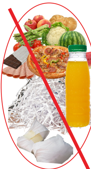
No Food, Liquids, Diapers, or Shredded Paper