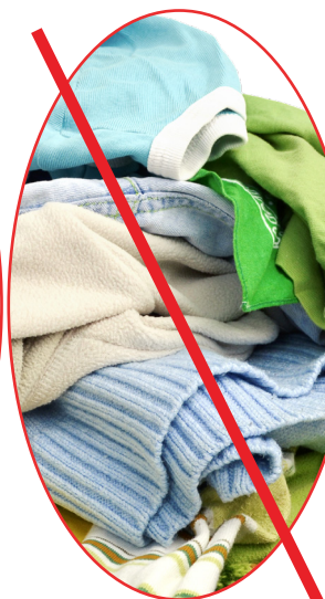
No Clothing or Shoes