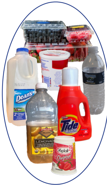
Plastic Bottles - Caps On Preferred, Tubs, Jugs, Jars No Bags, Film, or Foam