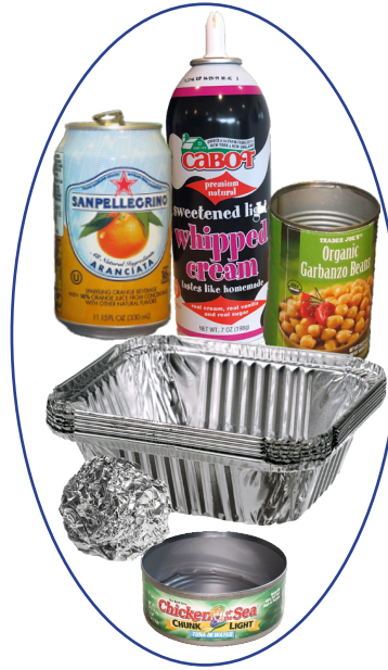
Metal Steel & Aluminum Depressurize Aerosols