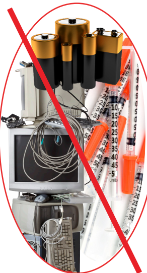
No Batteries, Electronics, or Sharps