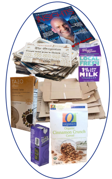
Mixed Paper & Cartons Flatten Boxes