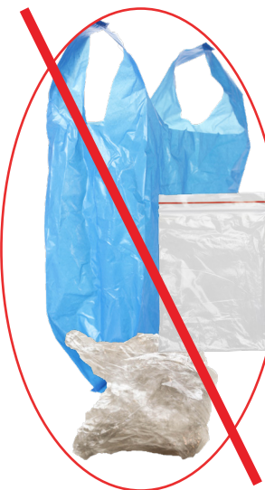
No Plastic Bags or Wrap