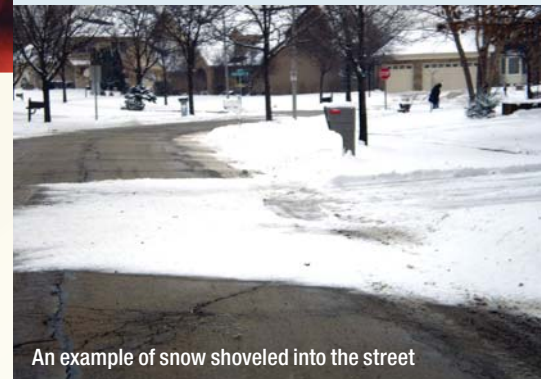
An example of snow shoveled into the street