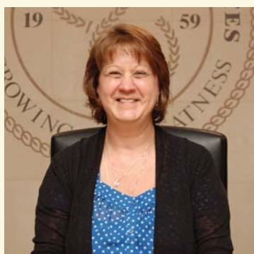
By Bev Romanoff Hoffman Estates Village Clerk

A: For starters, get a flu shot – it's not too late! Also, practice good hygiene, such as washing your hands often. Cough or sneeze into your elbow, not your hands. Avoid contact with sick people, and avoid touching your face (nose, mouth and eyes after touching surfaces that may be contaminated with flu germs). Finally, eat a balanced diet and drink plenty of fluids.