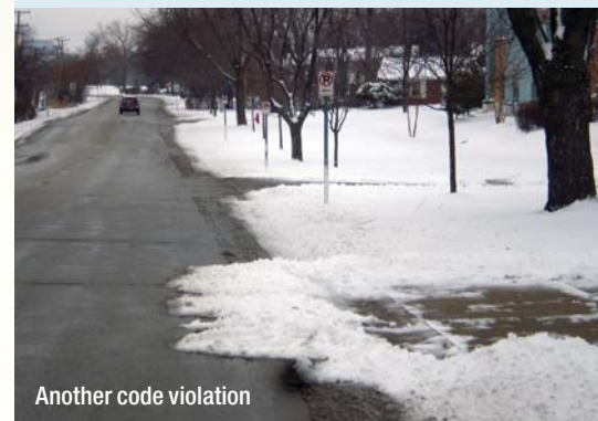
Another code violation

Be a good neighbor, and shovel snow away from the street.