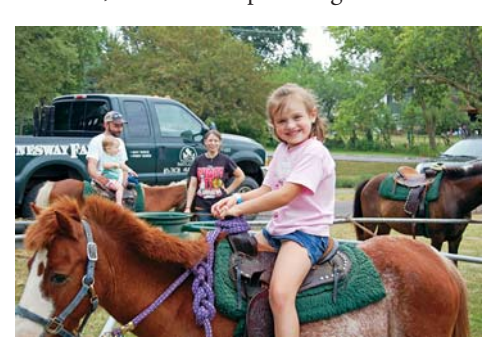
A guest enjoys horseback riding at last year's Party in the Park, sponsored by the Park District

It's the Hoffman Estates Park District's biggest event of the year! This year's Party in the Park takes place on Saturday, Aug. 6, from 4 p.m. to 10 p.m. at Fabbrini Park. Kids of all ages will love the exciting lineup of activities, including a balloon artist, pony rides, a trackless train, a petting zoo, a climbing wall, games, inflatables, contests, pickleball and a children's performer. Enjoy multicultural entertainment and food provided by the Village's Cultural Awareness Commission. The '90s tribute band Run Forrest Run will perform at 8:30 p.m. Admission is free. Wristbands can be purchased for games and other activities. Food and beverages will also be available for purchase. For a complete schedule, visit www.heparks.org.