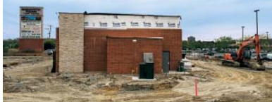
Construction of the new McDonald's at Barrington Square Mall

The previous Wendy's at Golf Center has been demolished to make way for a new restaurant at the same site with a modern façade. Look for more construction across town at the Route 59/I-90 interchange, as a new Culver's restaurant attached to a Mobil gas station is planned for a 2016 opening.