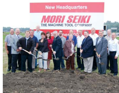
Elected officials and Village staff participate in Mori Seiki's groundbreaking on Sept. 12

Hoffman Estates is pleased to welcome Mori Seiki U.S.A., Inc., to the Village's expansive family of corporate headquarters. In early September, the Japanese company broke ground on a 7.5-acre site in the Huntington Woods Corporate Center during a ceremony with developers and Village officials. The new 102,000-square-foot facility will be situated at the intersection of W. Central Road and Huntington Boulevard, near AT&T's Midwest headquarters. Mori Seiki produces highly reliable machine tools and distributes worldwide. For more information about Mori Seiki, visit www.moriseikius.com .