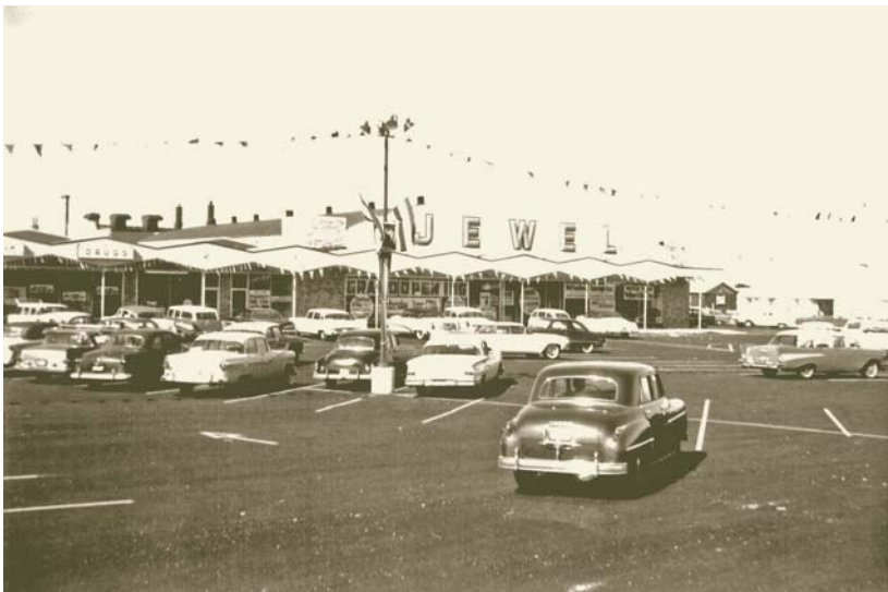
Picture from the original grand opening of Hoffman Plaza, circa early 1960s

In 2005, Golf Center, located on the southwest corner of Roselle and Golf Roads, embarked on a major remodel of their own. This $3 million makeover replaced and elevated their facade, and updated their parking lot, lighting and landscaping. The new look resulted in more tenants and increased business.